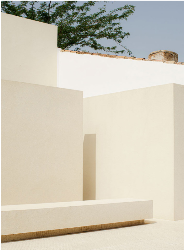
NURSERY SCHOOL. 2023