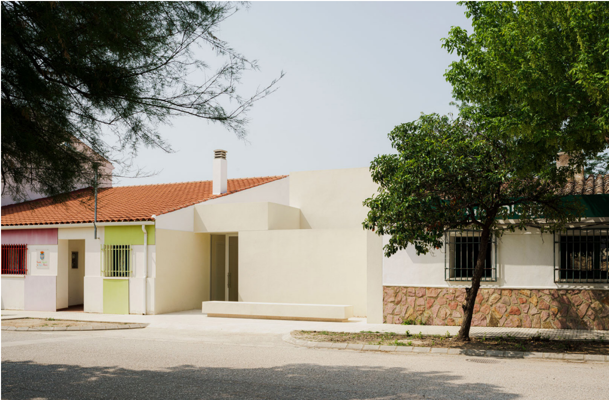
NURSERY SCHOOL. 2023