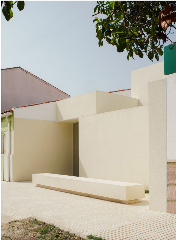
NURSERY SCHOOL. 2023