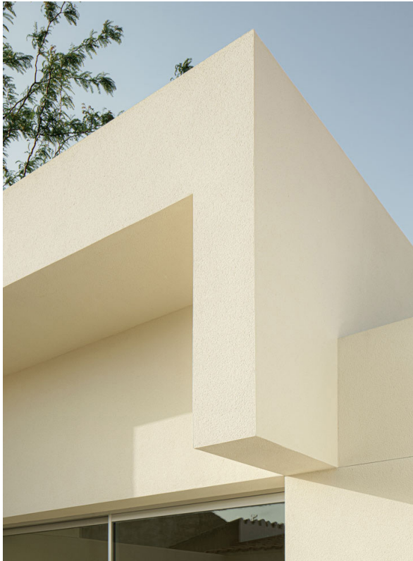
NURSERY SCHOOL. 2023