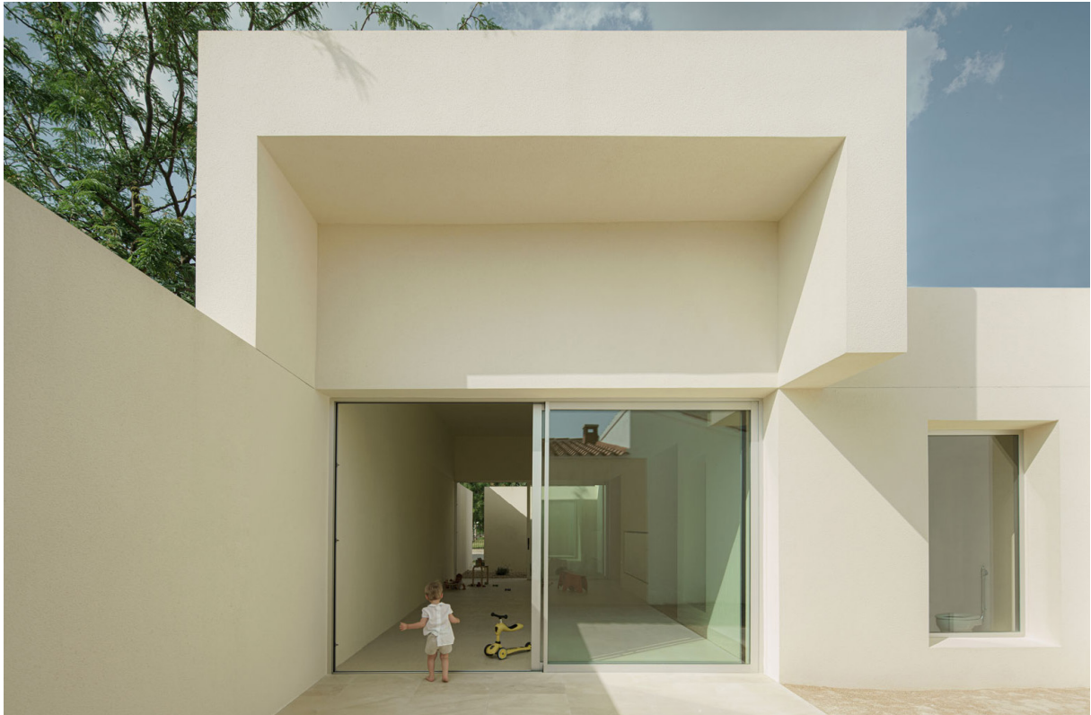
NURSERY SCHOOL. 2023