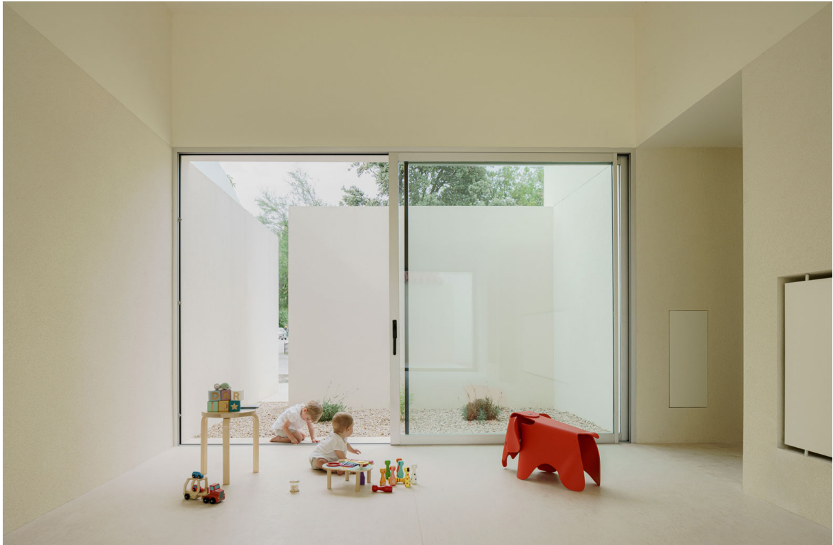
NURSERY SCHOOL. 2023