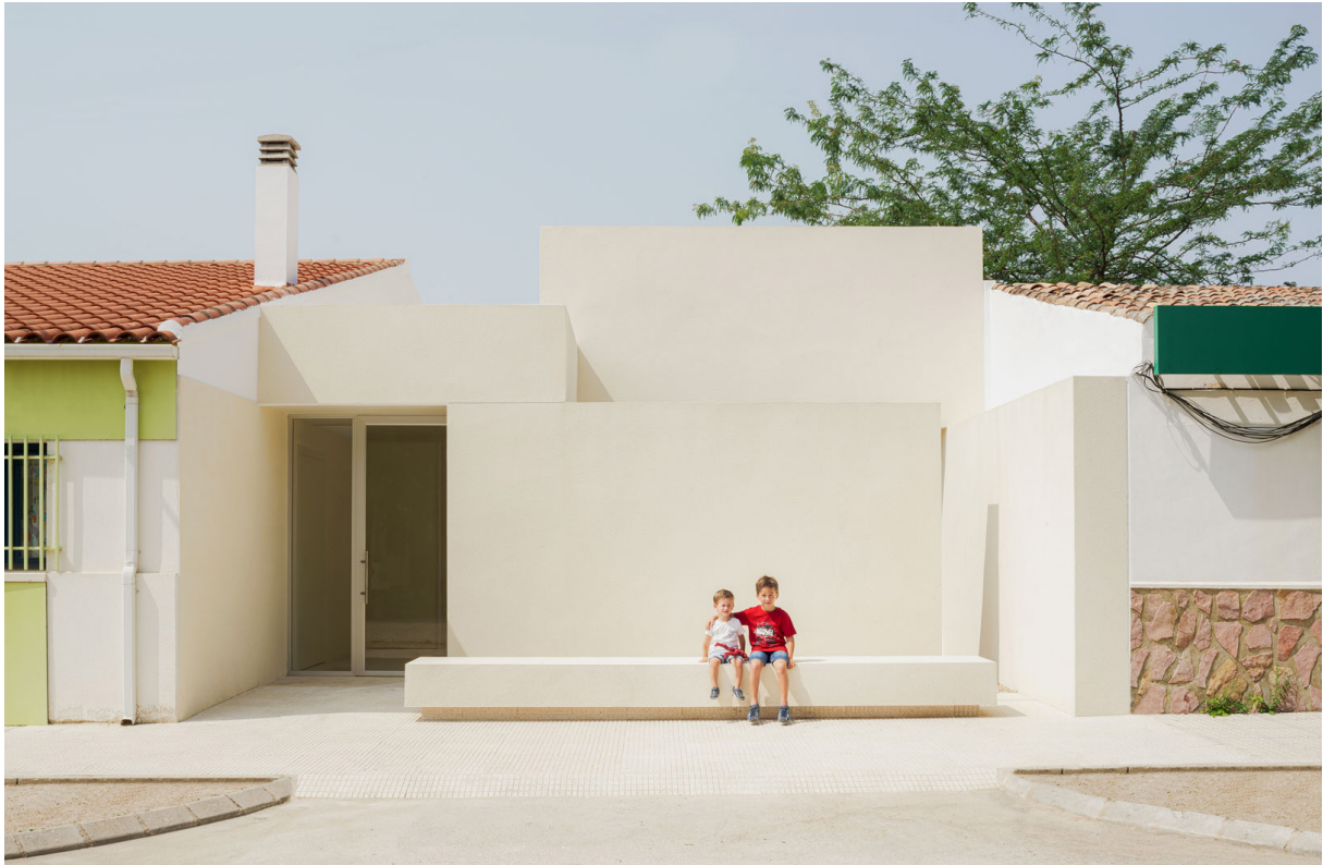
NURSERY SCHOOL. 2023