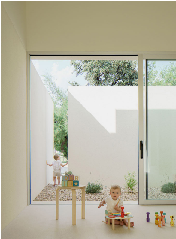
NURSERY SCHOOL. 2023